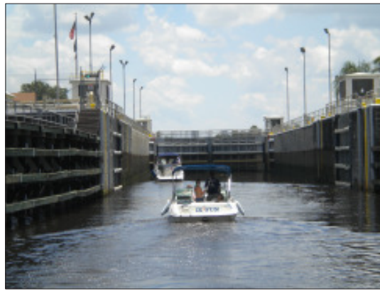
Boats navigate slowly into the Orton Lock on the Caloosahatchee River on the way home from the C&R